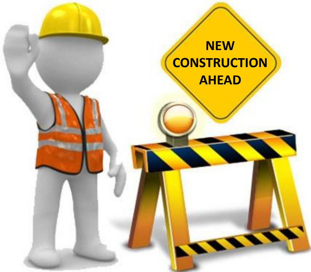
During the construction process, work crews will be working in the Easement area.